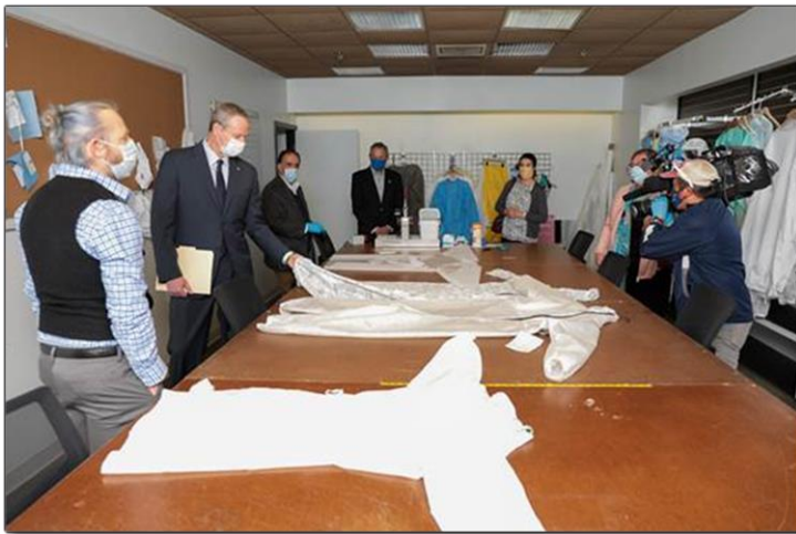
Governor Baker examines some of the personal protective equipment made by Merrow Manufacturing of Fall River during his visit to the facility.